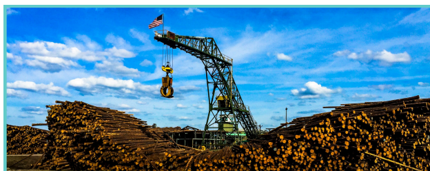
CHART INDUSTRIES - $100 MILLION

Canfor Southern Pine opened its new $210 million state-of-the-art sawmill complex in Axis, Alabama incorporating cutting-edge technology and advanced manufacturing. It also features a biomass-fueled lumber drying system to support the company's sustainability and decarbonization goals. Logs brought into the new sawmill will help create around 17,000 single-family homes every year. In 2026, Canfor will add a rail spur on site, investing an additional $3 Million.